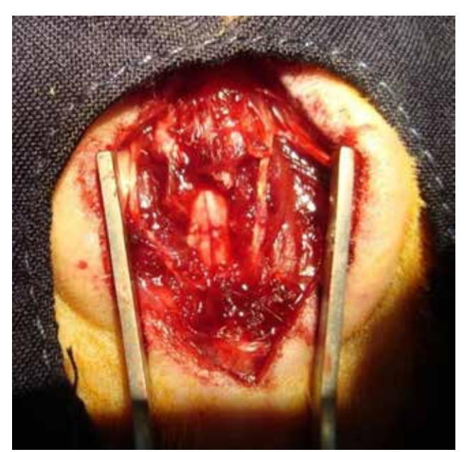
Figure 1. Clip application to the spinal cord.

Blood samples were centrifuged for 10 minutes at 3000 rpm to obtain serum for MDA and TAOC studies. Spinal cord segments I cm in length, which included injured cord area, were harvested as samples. Blood and tissue samples were transferred immediately to deep freezer for preservation at -80°C until biochemical testing was conducted. Measurement of lipid peroxide levels was performed using method described by Ohkawa et al., which consists of spectrophotometric measurement of color at 532 nm created by reaction of tiobarbuturic acid with MDA in acid environment. Protein levels were expressed as nmol/mg in tissue and as nmol/mL in plasma. <sup>[2]</sup> TAOC was measured using Total Antioxidant Status kit (Mega TIp San. Tic. Ltd. Şti., Gaziantep, Turkey) in automatic biochemical analyzer and results obtained were expressed as nmol Trolox Eq/L.<sup>[3]</sup>